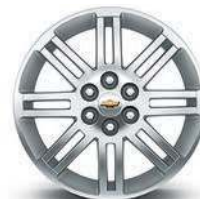
20" Machined-Aluminum with Painted Spokes (Available on 1LT; requires Style and Technology Package)