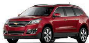
SIREN RED TINTCOAT 1,2