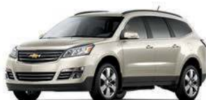
CHAMPAGNE SILVER METALLIC 2