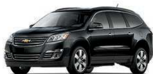
BLACK GRANITE METALLIC 1,2