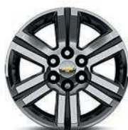
18" Machined-Aluminum (Standard on 1LT and 2LT)