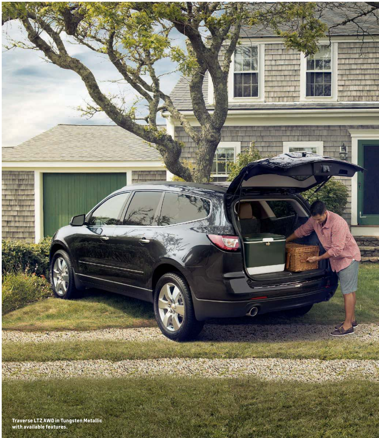
Traverse LTZ AWD in Tungsten Metallic with available features.