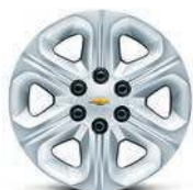
17" Steel with Painted Wheel Cover (Standard on LS)