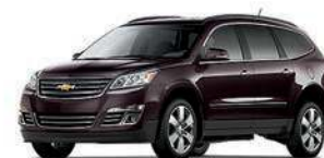
SABLE METALLIC 1,2