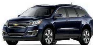
BLUE VELVET METALLIC