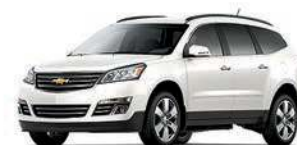
WHITE DIAMOND TRICOAT 1,2