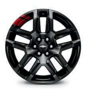
20" Gloss Black-Painted Aluminum with Red Accents (Available on Premier with Redline Edition)