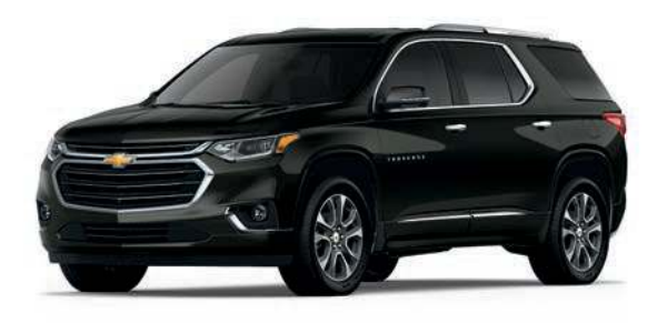
MOSAIC BLACK METALLIC<sup>1</sup>