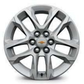
18" Bright Silver-Painted Aluminum (Standard on L and LS)