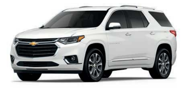
IRIDESCENT PEARL TRICOAT<sup>1,2,3</sup>