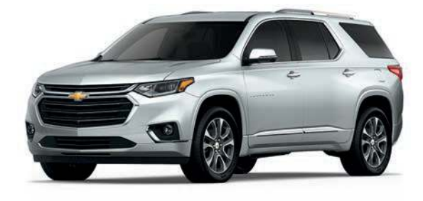
SILVER ICE METALLIC<sup>1,5</sup>