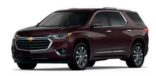
BLACK CURRANT METALLIC<sup>3,6</sup>