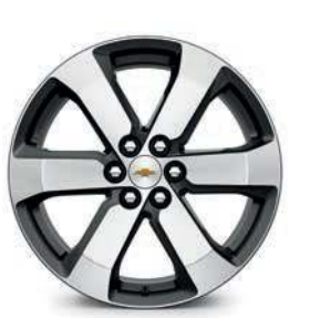
20" Machined-Face Aluminum with Technical Gray Pockets (Standard on LT Leather)