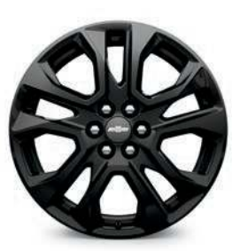
20" Dark Android-Painted Aluminum (Standard on RS)