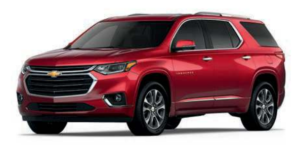
CAJUN RED TINTCOAT<sup>2,3</sup>