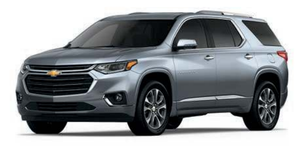
SATIN STEEL METALLIC<sup>4</sup>