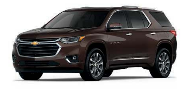
SABLE BROWN METALLIC<sup>7</sup>