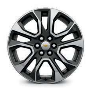
20" Argent Metallic Machined-Face Aluminum (Standard on Premier)