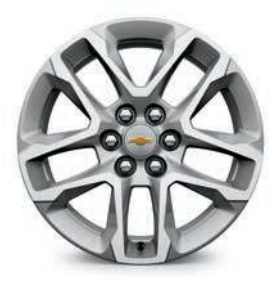
18" Bright Silver-Painted Machined-Face Aluminum (Standard on LT Cloth)