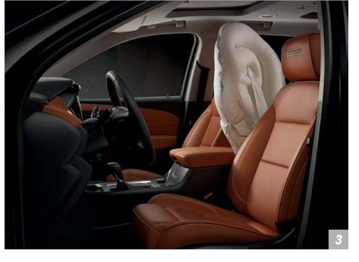
1 Air bag inflation can cause severe injury or death to anyone too close to the bag when it deploys. Be sure every occupant is properly restrained. A NOTE ON CHILD SAFETY: Always use safety belts and the correct child restraint for your child's age and size, even with air bags. Even in vehicles equipped with the Passenger Sensing System, children are safer when properly secured in a rear seat in the appropriate infant, child or booster seat. Never place a rear-facing infant restraint in the front seat of any vehicle equipped with an active frontal air bag. See the Owner's Manual and the child safety seat instructions for more safety information.