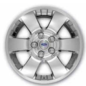
16" Bright Machined-Aluminum Standard on Limited and Hybrid Limited