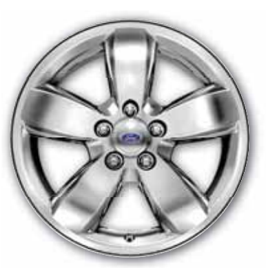
17" Chrome-Clad Aluminum Optional on XLT and Limited