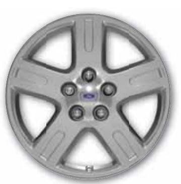
16" Cast-Aluminum Standard on Hybrid