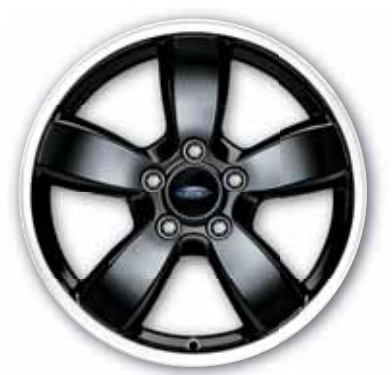
17" Premium Black with Machined-Finish Outer Ring Sport Appearance Package on XLT