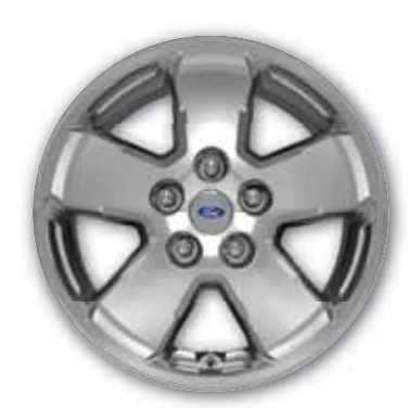
16" Cast-Aluminum Standard on XLS and XLT