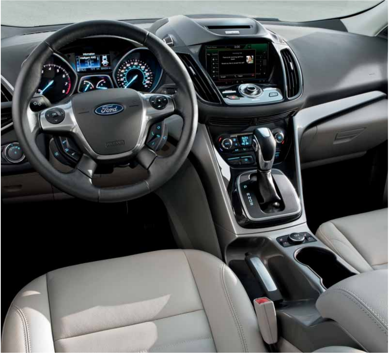
Medium Light Stone leather trim. Available equipment. | Dual-zone electronic automatic temperature control. | Chrome finish accents. | Leather-wrapped shift knob. | Heated front bucket seats.