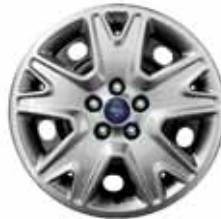
17" Steel with Sparkle Silver-Painted Wheel Covers Standard on S

1 Medium Light Stone Cloth – Standard on SE 2 Charcoal Black Cloth – Standard on S and SE