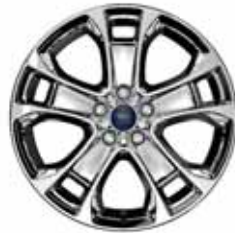
18" Chrome Alloy Finish Aluminum Optional