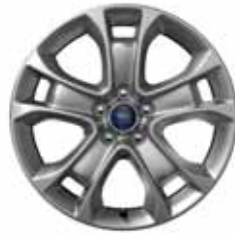
18" Sparkle Nickel-Painted Aluminum Standard