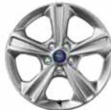
17" Sparkle Silver-Painted Aluminum Standard on SE