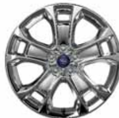
18" Polished Aluminum Available on SE