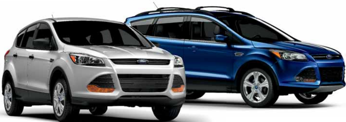
S. Ingot Silver Metallic. SE. Deep Impact Blue Metallic. Available equipment.

Visit accessories.ford.com to shop the complete collection