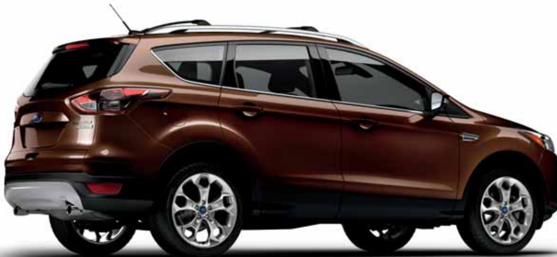
Kodiak Brown Metallic. Available equipment.

Visit accessories.ford.com to shop the complete collection