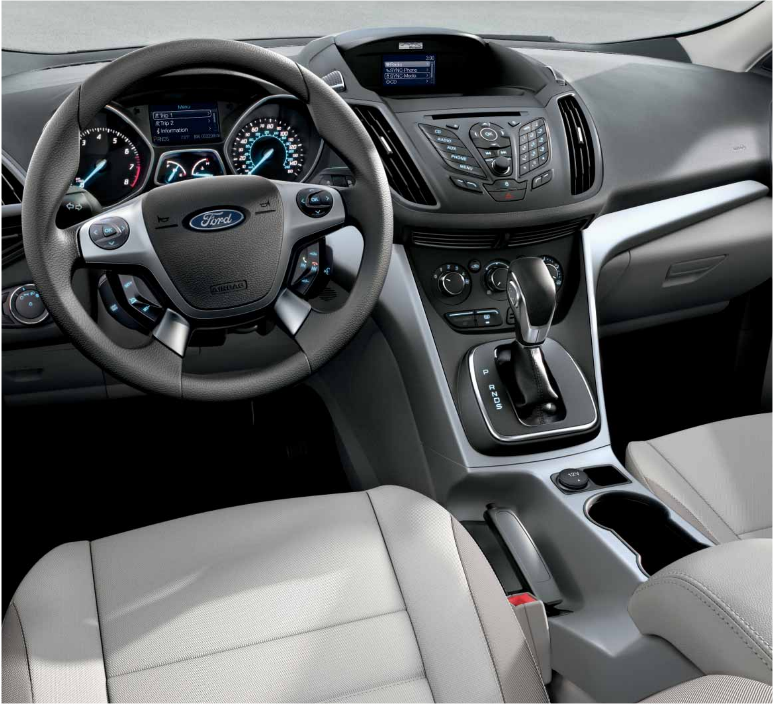
SE. Medium Light Stone cloth trim. | SE. 2nd-row 60/40 split seat with reclining seat backs. | Overhead console with sunglasses holder. | Ford SYNC ®