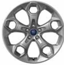
19" Luster Nickel-Painted Aluminum Standard

1 Premium Charcoal Black Cloth/Leather – Standard 2 Charcoal Black Leather – Optional