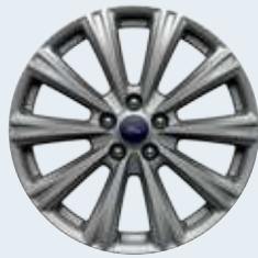
18" Sparkle Silver-Painted Aluminum Standard: Titanium