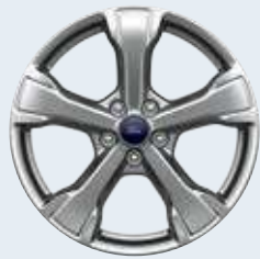
18" Ultra Bright-Machined Aluminum Available: SE