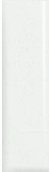
White Platinum Metallic Tri-coat

5,6: Requires Leather Comfort Package on SE