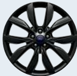
19" Ebony Black-Painted Aluminum Included: SE Sport Appearance Package