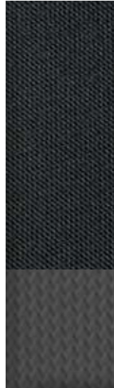
Unique Charcoal Black Cloth