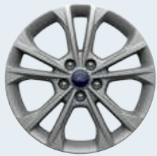
17" Sparkle Silver-Painted Aluminum Optional: S