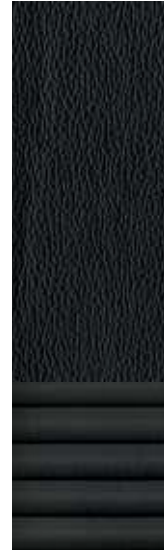
Charcoal Black Partial Leather