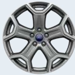
19" Machined Aluminum with Luster Nickel-Painted Spokes and Pockets Optional: Titanium