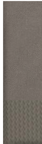
Medium Light Stone Cloth