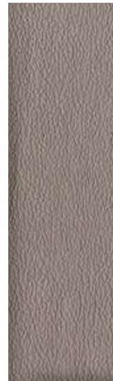
Medium Light Stone Leather