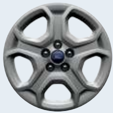
17" Steel with Sparkle Silver-Painted Wheel Covers Standard: S