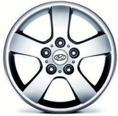
16-INCH GLS ALLOY WHEEL