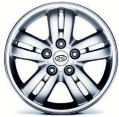
16-INCH SE/LIMITED ALLOY WHEEL