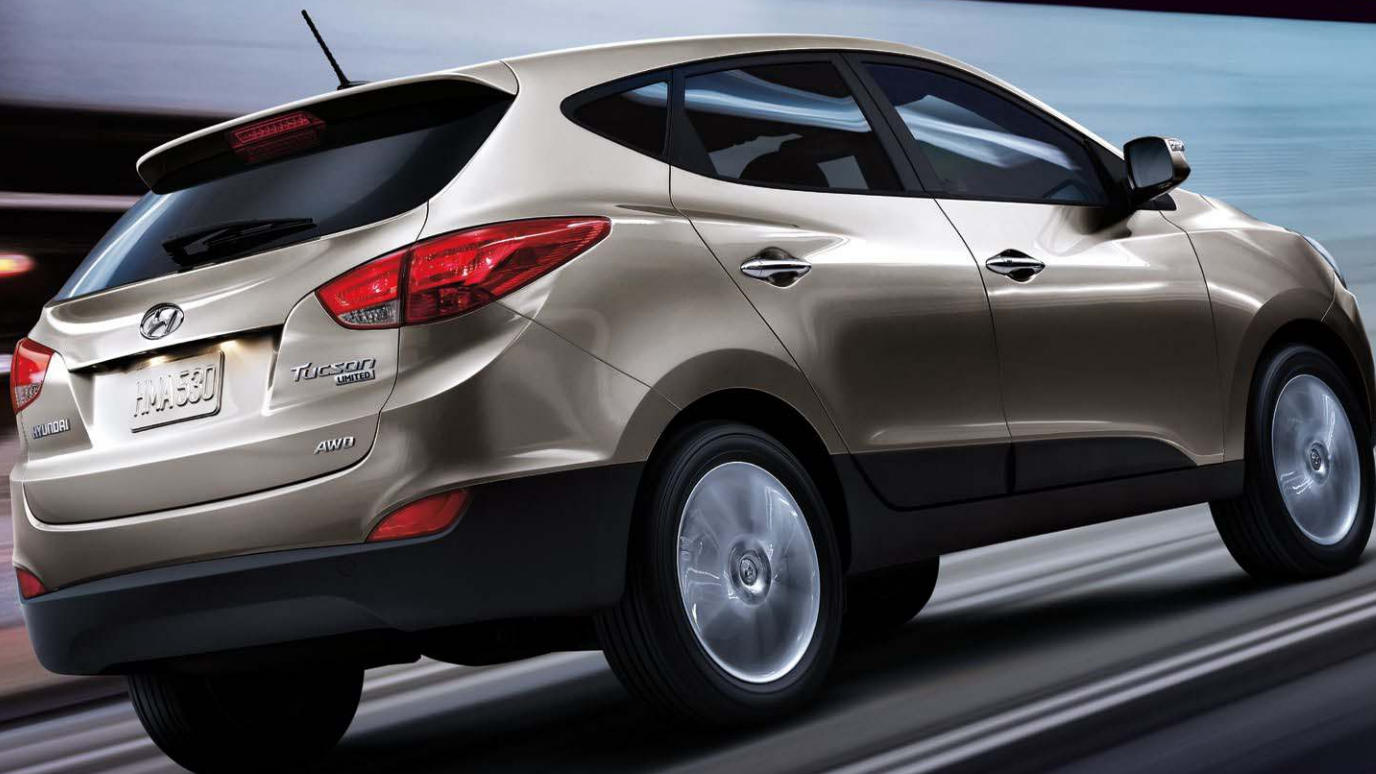
TUCSON LIMITED PREMIUM PACKAGE in Chai Bronze