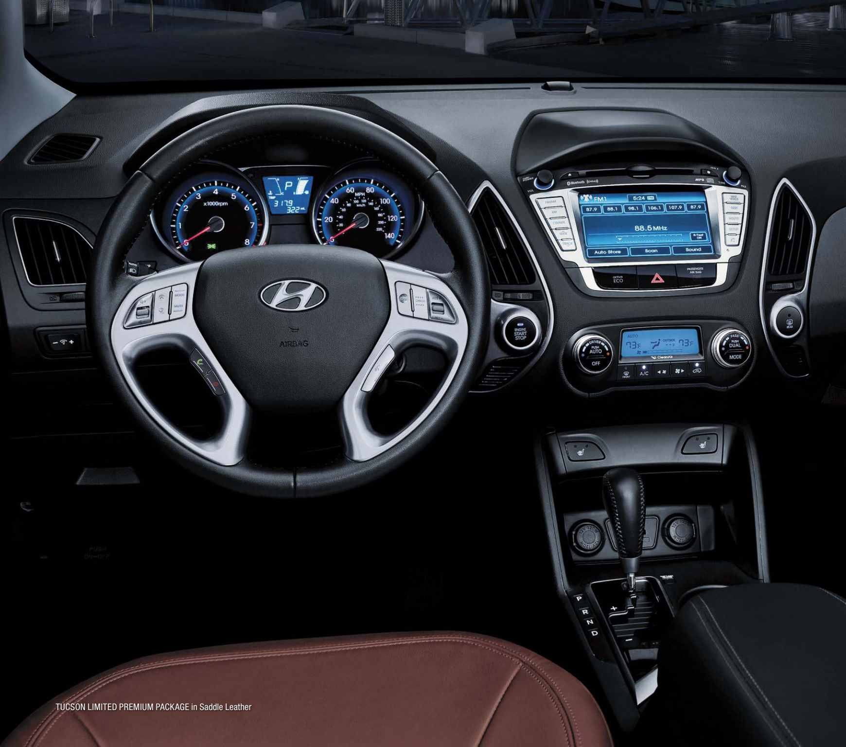
TUCSON LIMITED PREMIUM PACKAGE in Saddle Leather