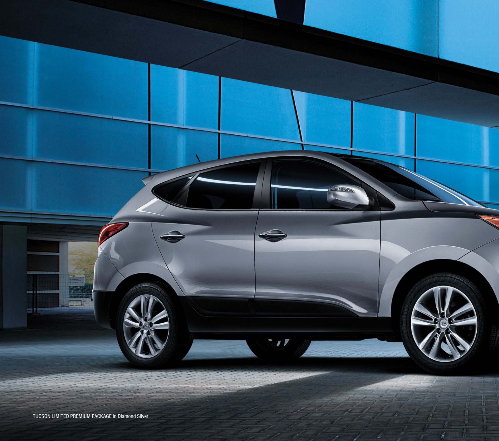
TUCSON LIMITED PREMIUM PACKAGE in Diamond Silver