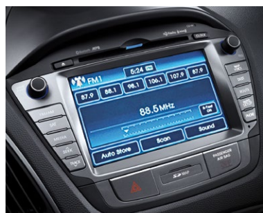
TUCSON LIMITED TECHNOLOGY PACKAGE in Brown Leather

ENHANCED AUDIO Tucson's available 360-Watt premium audio system uses 7 speakers, including a subwoofer. And it lets you get your music from multiple sources. There's SiriusXM® or Bluetooth® streaming from your compatible device. A USB jack lets you plug those same devices directly into Tucson's audio system. Your selections appear on a 4.3" or available 7" color touchscreen – the same screen used to display the view from the rearview camera.