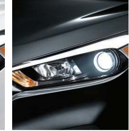
Black Noir Pearl