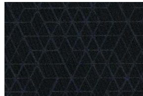
SE / Eco / Sport