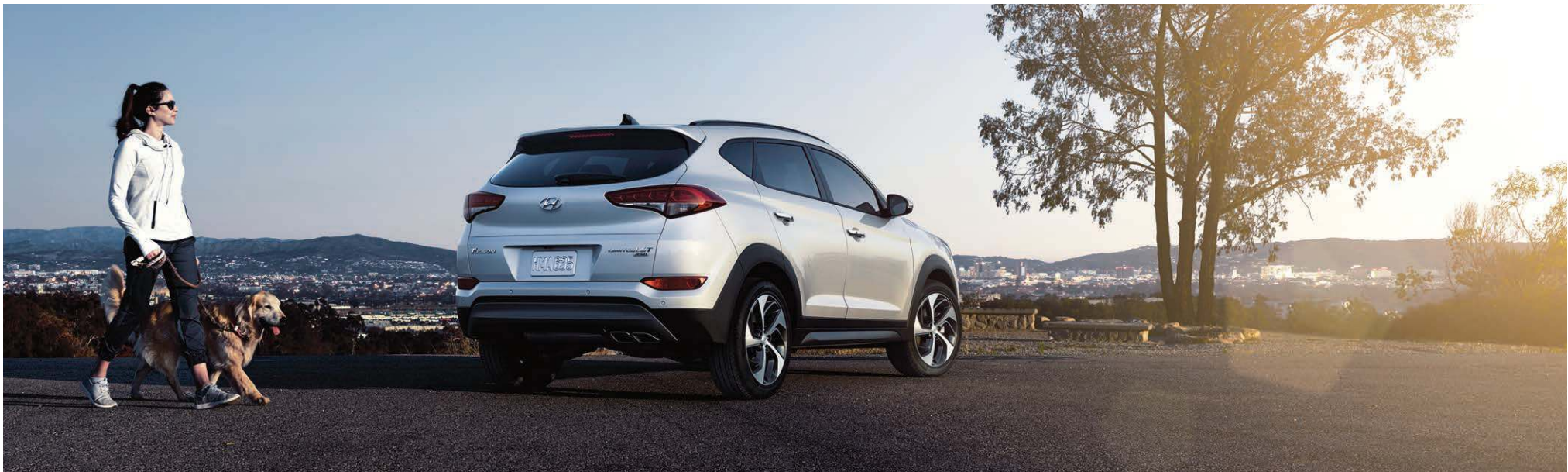
19" Alloy Wheel Sport / Limited