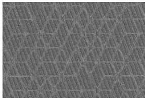
SE / Eco / Sport