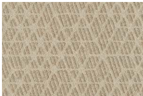
SE / Eco / Sport