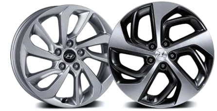
17" Alloy Wheel SE / Eco