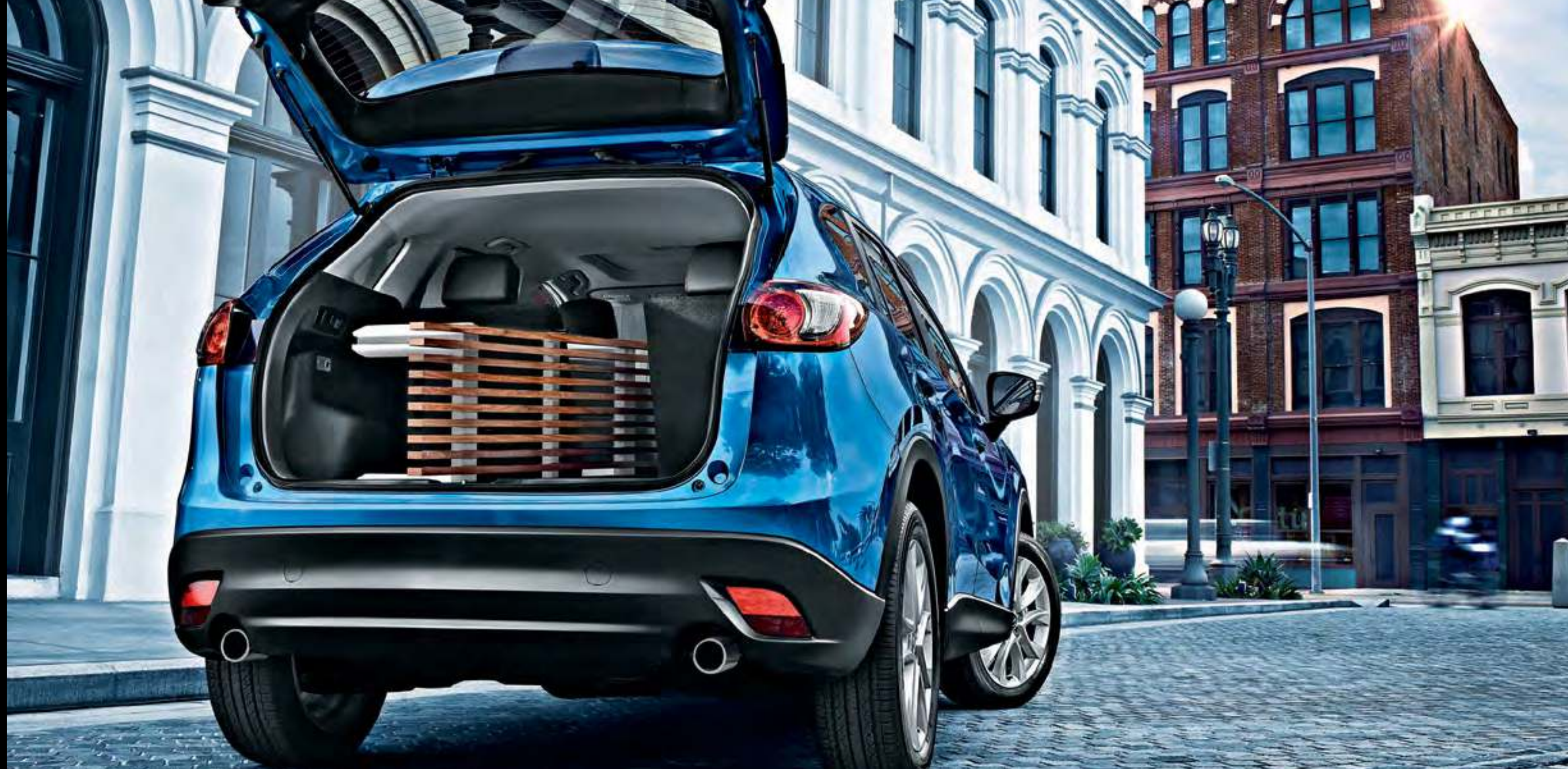
Other available features include: