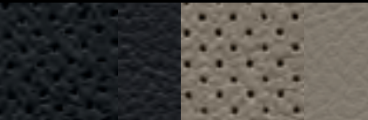
Black Leather (Grand Touring) Sand Leather (Grand Touring)