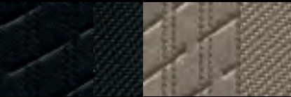
Black Premium Cloth (Touring) Sand Premium Cloth (Touring)