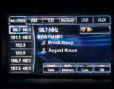
SiriusXM Satellite Radio 1