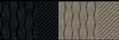
Black Cloth (Sport) Sand Cloth (Sport)