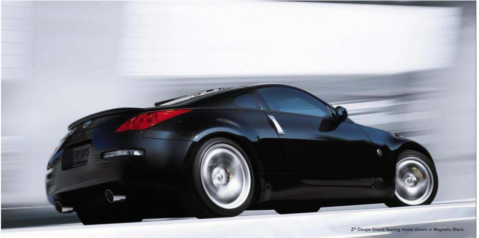
Z® Coupe Grand Touring model shown in Magnetic Black.