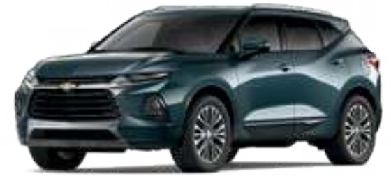
GRAPHITE METALLIC 1