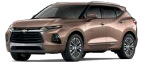
OAKWOOD METALLIC 3,4