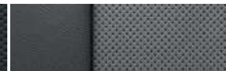
Dark Galvanized/Light Galvanized Perforated Leather-Appointed Seating Surfaces (shown)