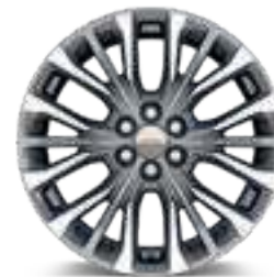
20" Machined-Face Aluminum Wheels with Medium Android-Painted Pockets Standard on Premier

Seating surfaces – leather-appointed with sueded microfiber inserts