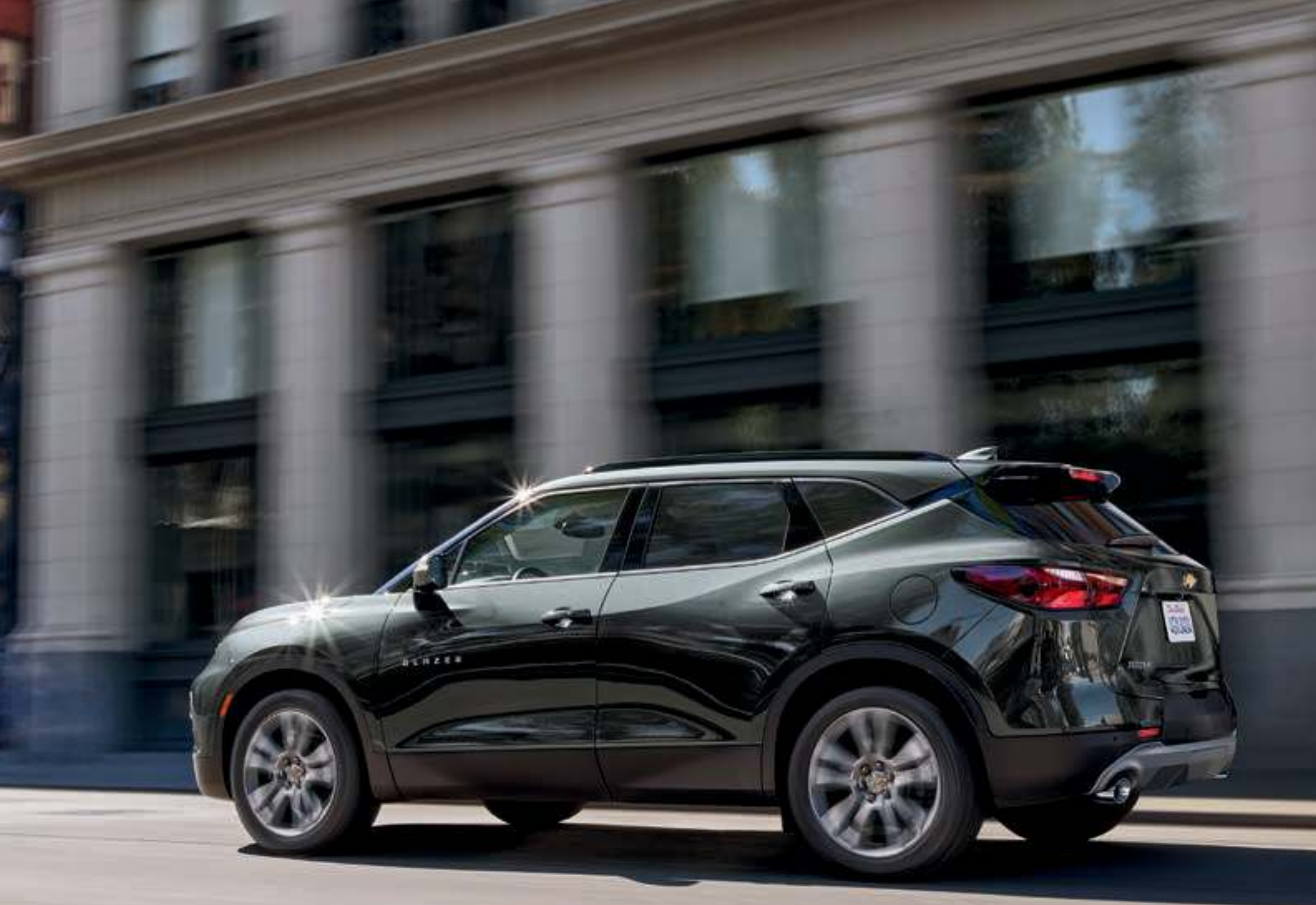
Blazer in Graphite Metallic with available features including 20-inch wheels.