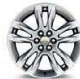
20" Bright Silver-Painted Aluminum Wheels Available on Blazer with Sun and Wheels Package