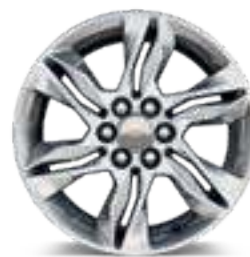
18" Bright Silver-Painted Aluminum Wheels Standard on Blazer