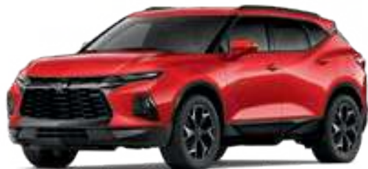
RED HOT 2,5