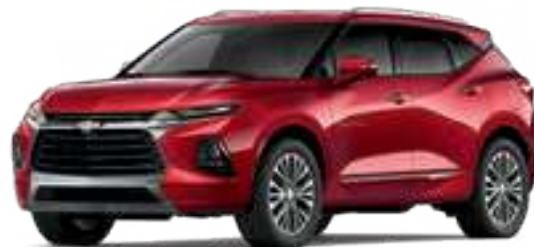
CAJUN RED TINTCOAT 3,6