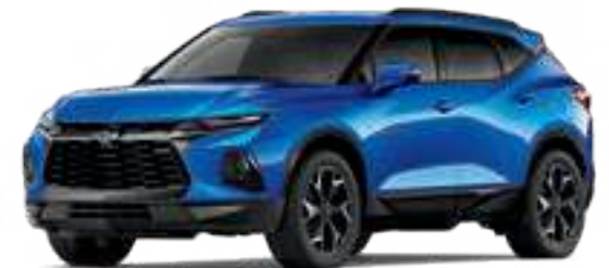
KINETIC BLUE METALLIC 2,5,6