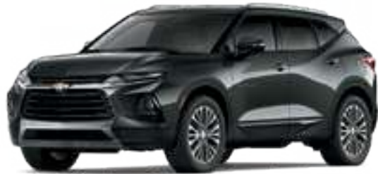
NIGHTFALL GRAY METALLIC 1