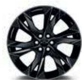
21" Gloss Black-Painted Aluminum Wheels Available on RS with Sun and Wheels Package