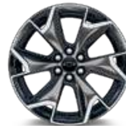
20" Machined-Face Aluminum Wheels with Dark Android-Painted Pockets Standard on RS

Lighting – ambient with pin spot lighting in the map pocket area, True White light pipes on the passenger side of the instrument panel and below the front door handles, and LED lighting between the center console cup holders