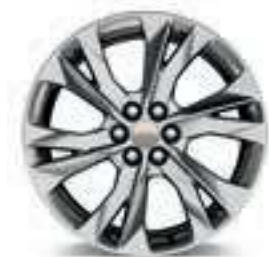
21" Pearl Nickel-Painted Aluminum Wheels Available on Premier with Sun and Wheels Package