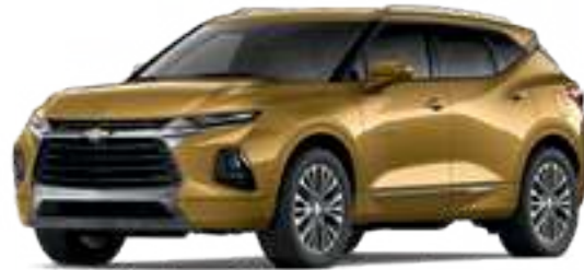
SUNLIT BRONZE METALLIC 1,2