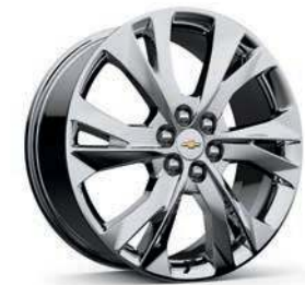
21" Pearl Nickel-Painted Aluminum Wheels Available on Premier

PREMIER In addition to or replacing RS features, Premier includes: