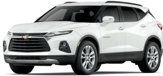
Summit White 1,2