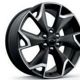
20" Machined-Face Aluminum Wheels with Dark Android-Painted Pockets Standard on RS