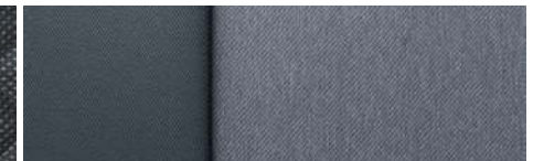
Dark Galvanized/Light Galvanized Premium Cloth 3

1LT In addition to or replacing L features, 1LT includes: