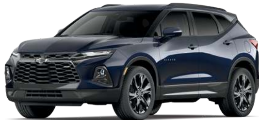
Midnight Blue Metallic 3