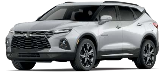
Silver Ice Metallic