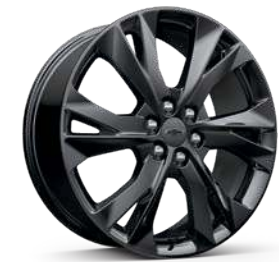
21" Gloss Black-Painted Aluminum Wheels Available on RS

RS In addition to or replacing 3LT features, RS includes: