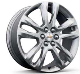
20" Bright Silver-Painted Aluminum Wheels Available on 3LT