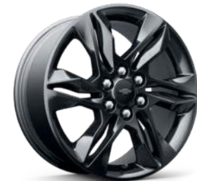
18" Gloss Black-Painted Aluminum Wheels Available on 1LT and 2LT with Midnight/Sport Edition