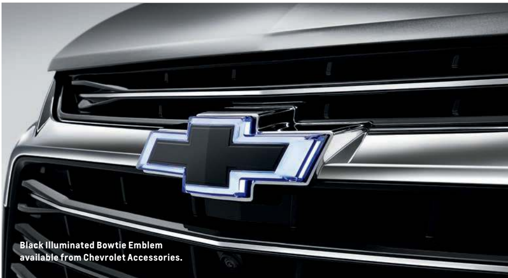
Black Illuminated Bowtie Emblem available from Chevrolet Accessories.