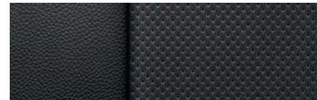
Jet Black Perforated Leather-Appointed Seating Surfaces with Red Accents