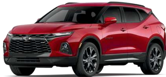
Cherry Red Tintcoat 3,4