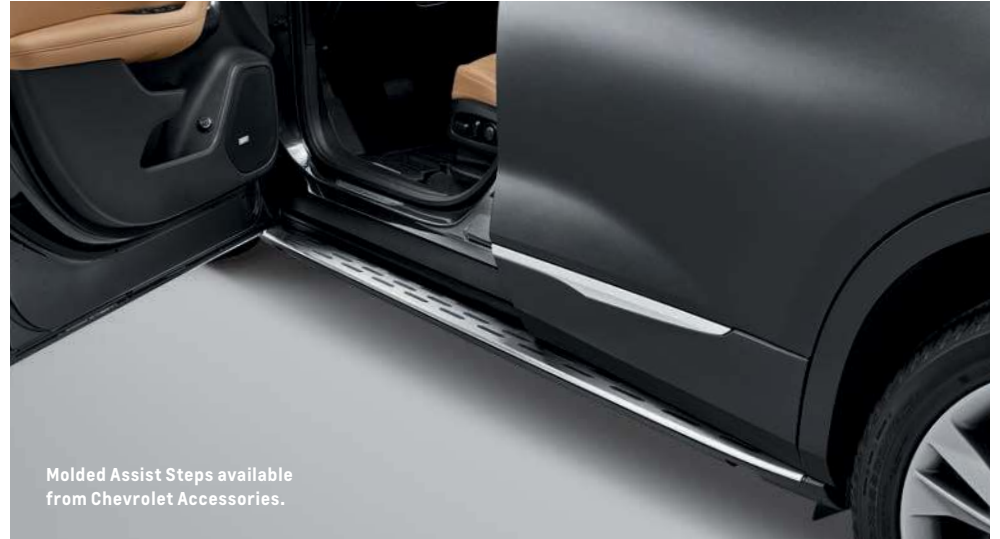
Molded Assist Steps available from Chevrolet Accessories.