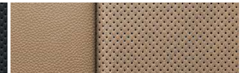
Maple Sugar Perforated Leather-Appointed Seating Surfaces with Sueded Microfiber Inserts (shown)