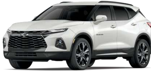
Iridescent Pearl Tricoat 3,4