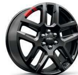
20" Gloss Black-Painted Aluminum Wheels with Red Accents Available on 2LT with Redline Edition