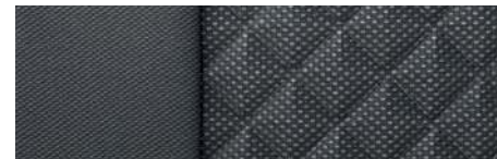
Jet Black Premium Cloth (shown)