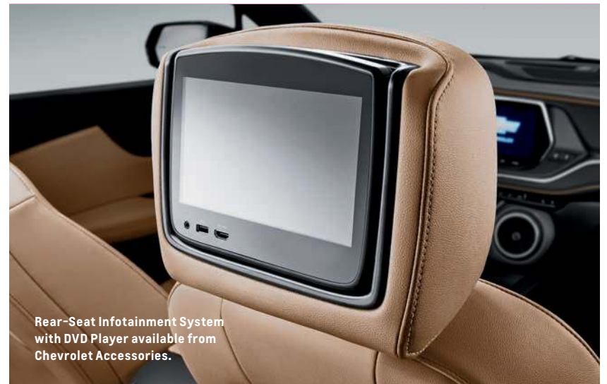
Rear-Seat Infotainment System with DVD Player available from Chevrolet Accessories.