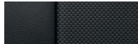
Jet Black Perforated Leather-Appointed Seating Surfaces with Sueded Microfiber Inserts