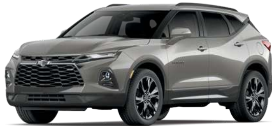
Pewter Metallic 3