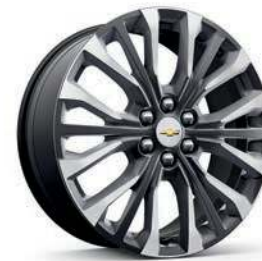
20" Machined-Face Aluminum Wheels with Medium Android-Painted Pockets Standard on Premier