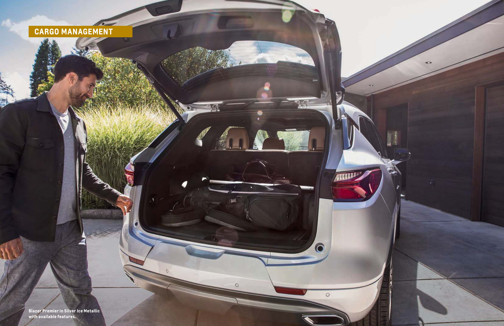
Blazer Premier in Silver Ice Metallic with available features.

Blazer features a versatile, flexible system that helps make cargo management, and carrying passengers, a beautifully simple endeavor.