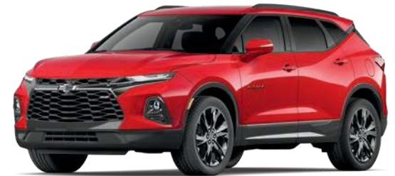
Red Hot 2,3