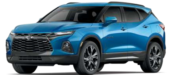
Bright Blue Metallic 4,5