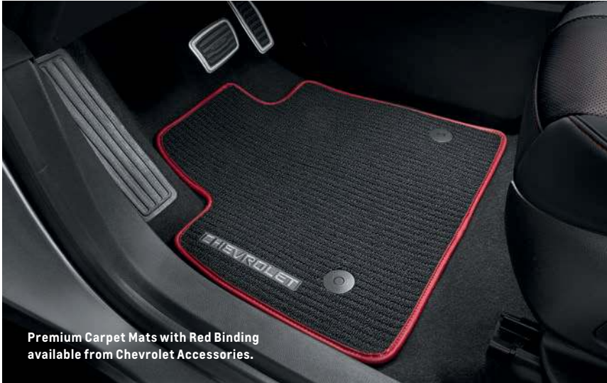
Premium Carpet Mats with Red Binding available from Chevrolet Accessories.