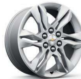
18" Bright Silver-Painted Aluminum Wheels Standard on 1LT and 2LT

Lane Keep Assist with Lane Departure Warning 2