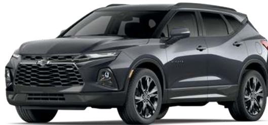
Iron Gray Metallic 3