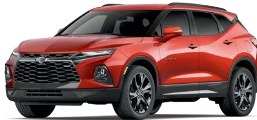
Cayenne Orange Metallic 3,4