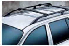
ROOF CROSS RAILS THAT ACCOMMODATE SKI, SNOWBOARD AND BIKE CARRIERS.