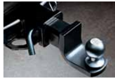
A CONVENIENT TOW HITCH IS READY TO HAUL YOUR TOYS TO YOUR FAVORITE DESTINATIONS.