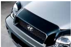
A DEALER-INSTALLED HOOD DEFLECTOR PROTECTS THE FINISH AGAINST DIRT, DEBRIS AND CHIPS.