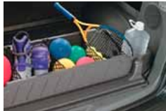
A FOLDING CARGO ORGANIZER CONVENIENTLY KEEPS YOUR STORAGE SPACE TIDY.

If you'd like to customize your Santa Fe, please see your Hyundai dealer for the full line of Hyundai accessories. You should always use genuine Hyundai parts and accessories, which meet strict standards for quality and durability.