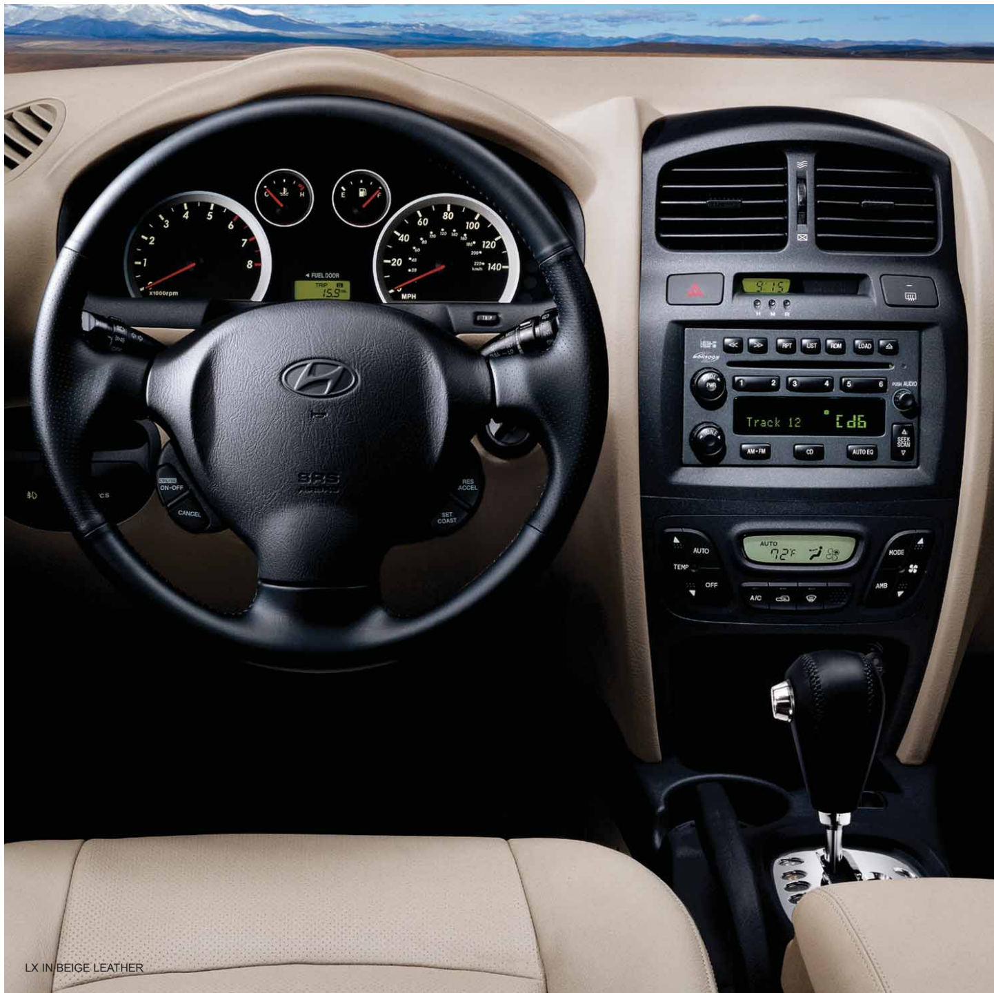
LX IN BEIGE LEATHER