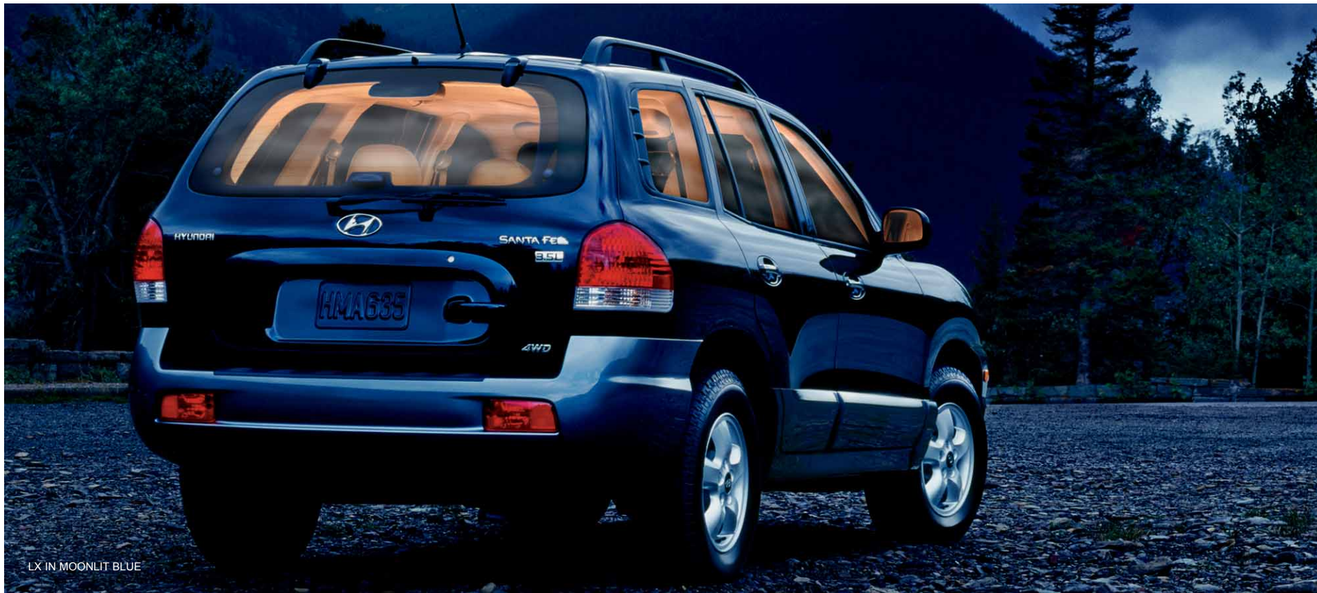
LX IN MOONLIT BLUE