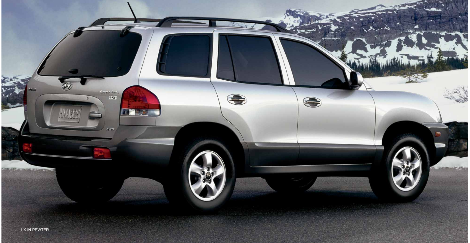
LX IN PEWTER