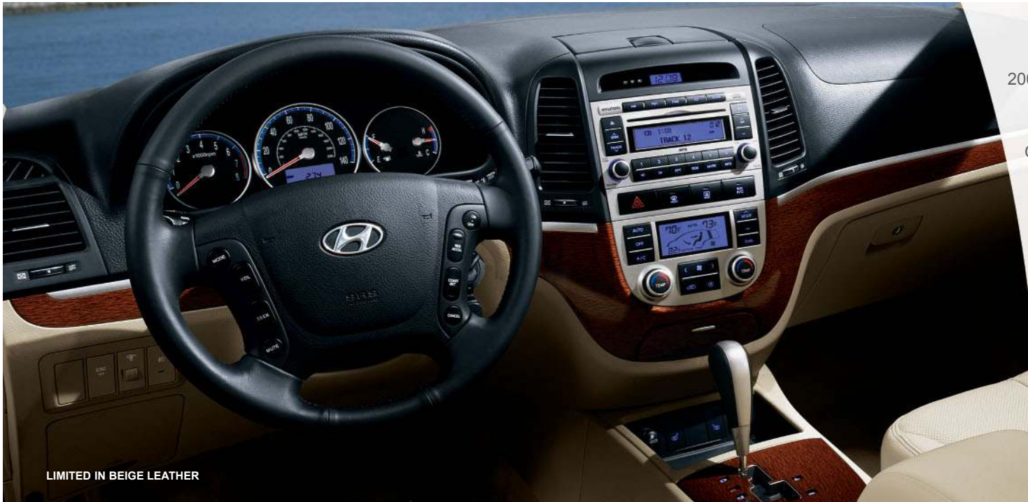
LIMITED IN BEIGE LEATHER