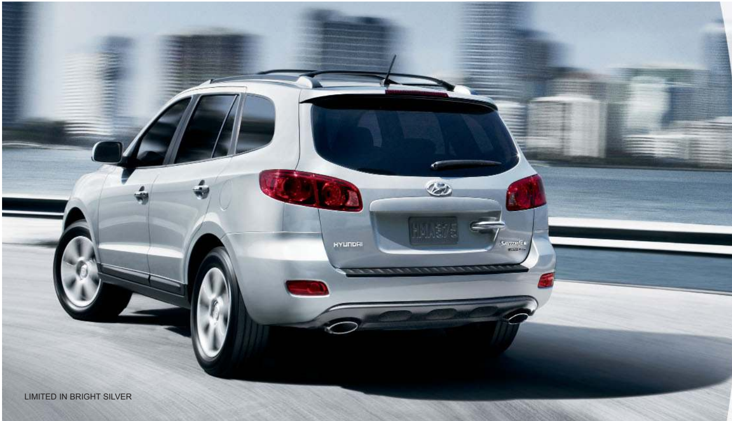
LIMITED IN BRIGHT SILVER