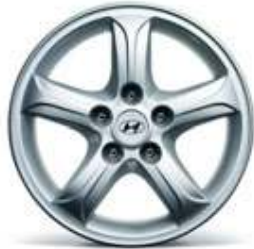
16-INCH ALLOY WHEEL