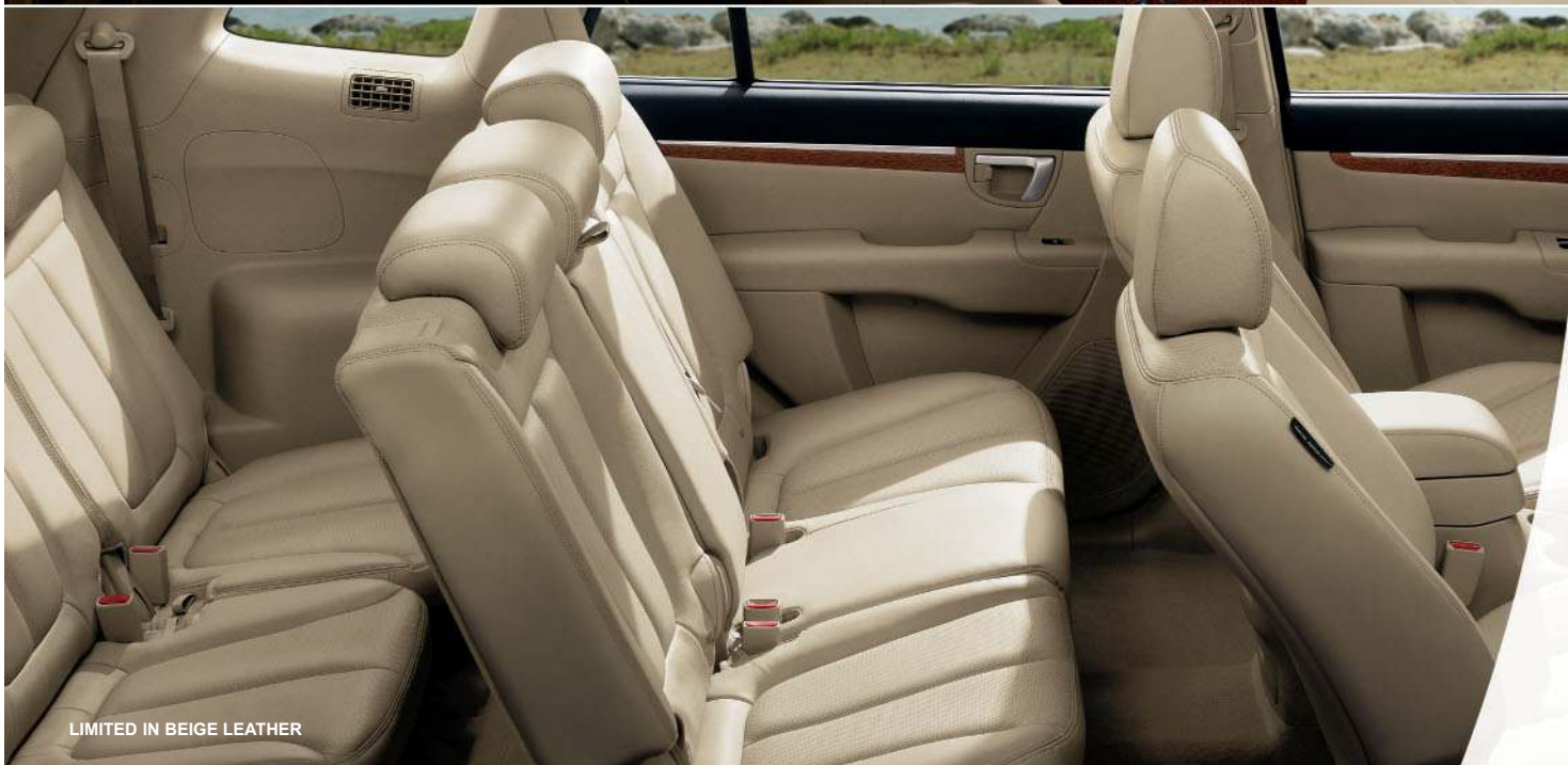
LIMITED IN BEIGE LEATHER