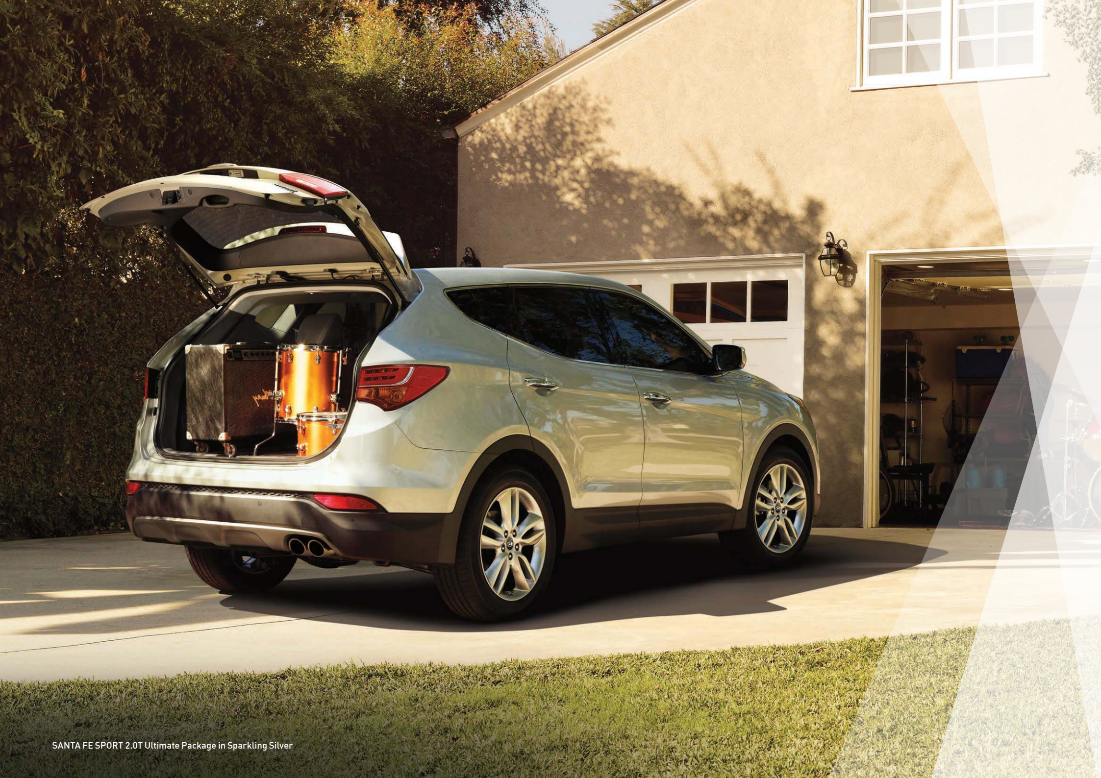
SANTA FE SPORT 2.0T Ultimate Package in Sparkling Silver