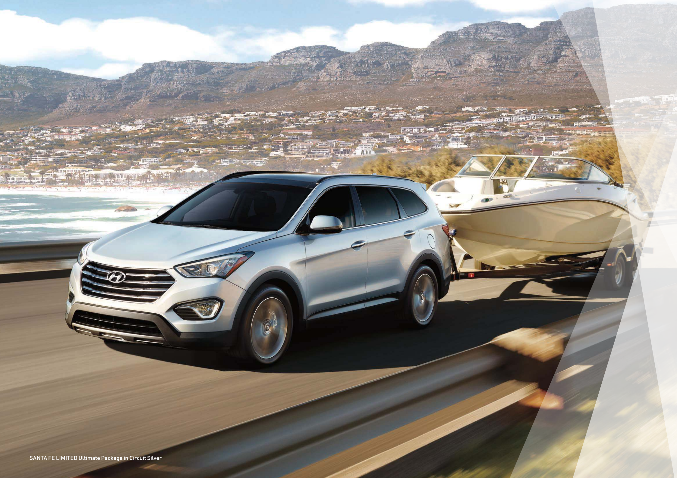
SANTA FE LIMITED Ultimate Package in Circuit Silver