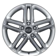
17" Alloy Wheel 2.4L