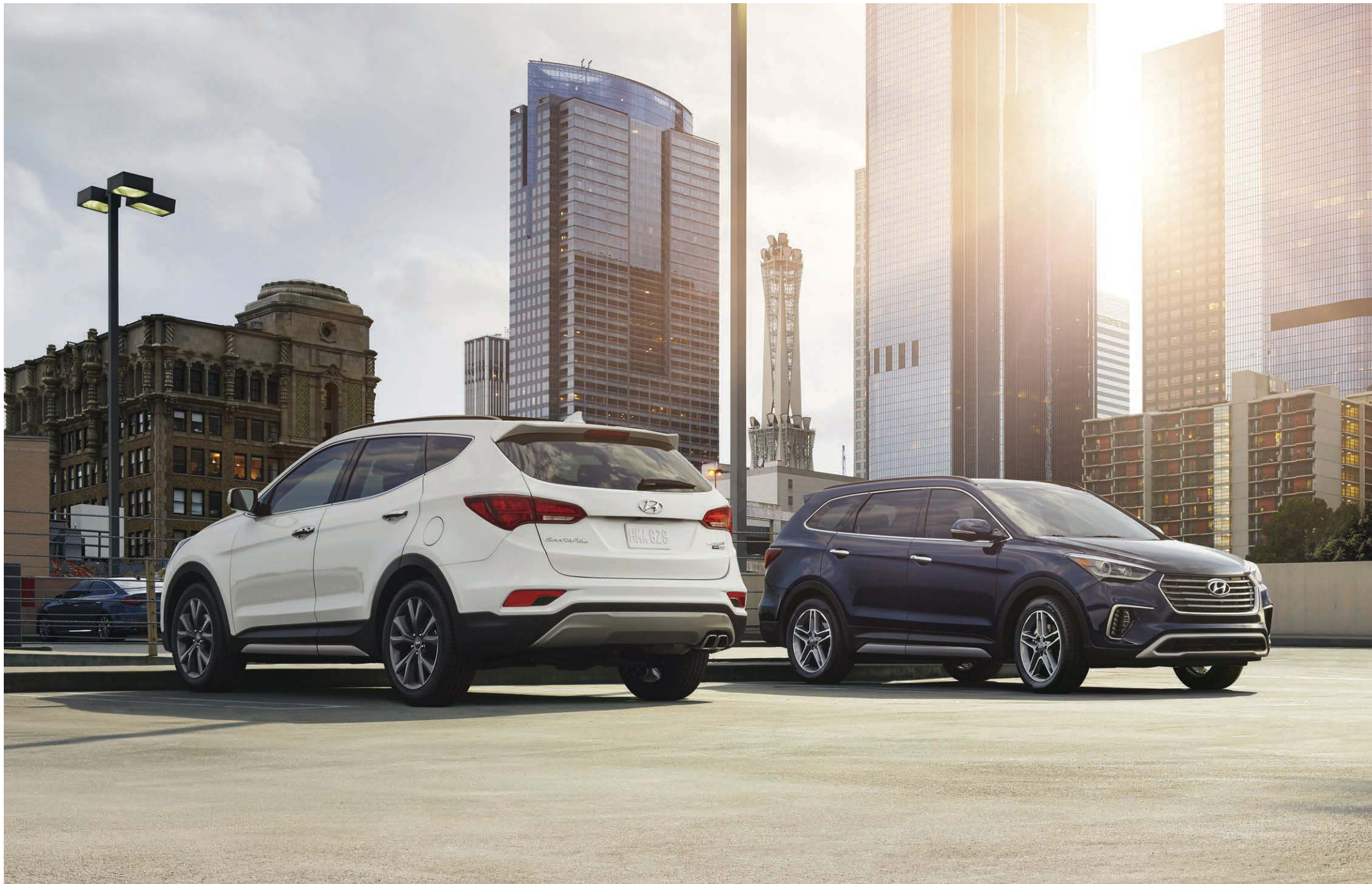
Santa Fe Sport 2.0T Ultimate Tech Package in Pearl White / Santa Fe Limited Ultimate Tech Package in Storm Blue