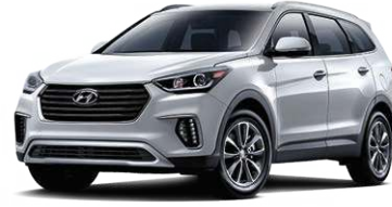
2018 Santa Fe SE (7-passenger)