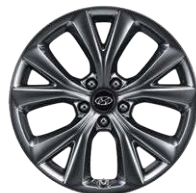
19" Alloy Wheel 2.0T Ultimate