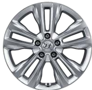
18" Alloy Wheel 2.0T