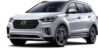
2018 Santa Fe Limited Ultimate (6-passenger)