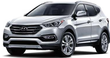
2018 Santa Fe Sport 2.0T