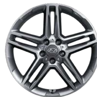
19" Alloy Wheel SE Ultimate/Limited Ultimate