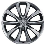
18" Alloy Wheel SE