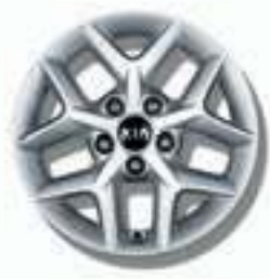
S 16" ALLOY WHEELS