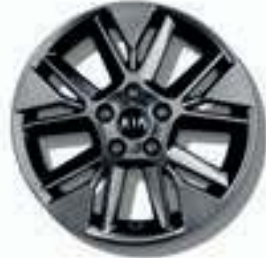
EX 17" ALLOY WHEELS