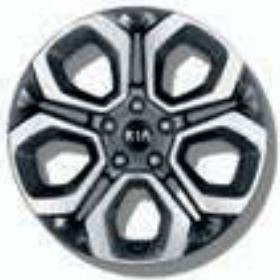
X-LINE 18" ALLOY WHEELS