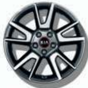
GT-LINE, GT-LINE TURBO 18" ALLOY WHEELS