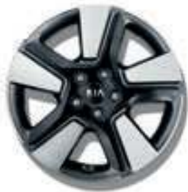
EX DESIGNER PACKAGE 18" ALLOY WHEELS (BLACK SPOKE)