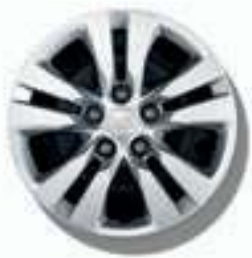
LX 16" STEEL WHEELS

Soul offers the following unique wheel designs: