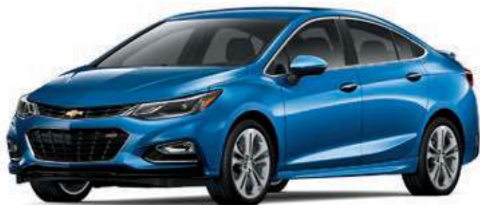
KINETIC BLUE METALLIC 1,2