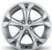
17" Aluminum (Standard on Premier)