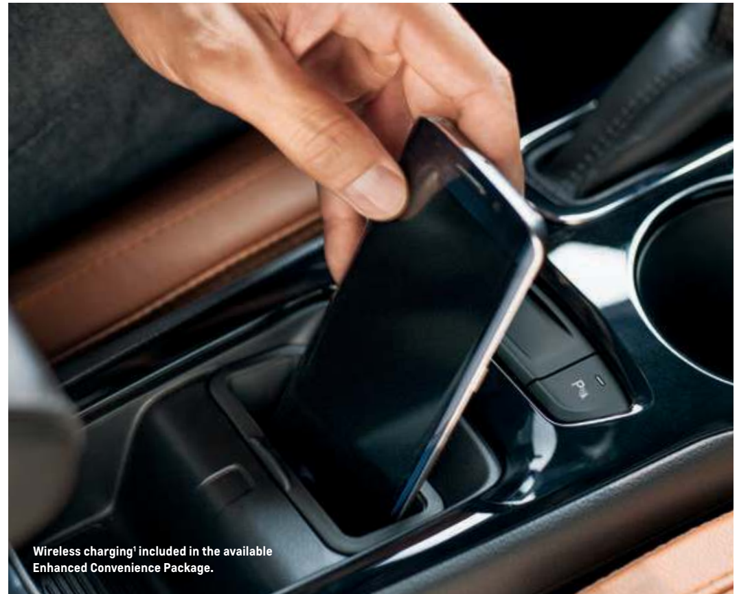
Wireless charging 1 included in the available Enhanced Convenience Package.