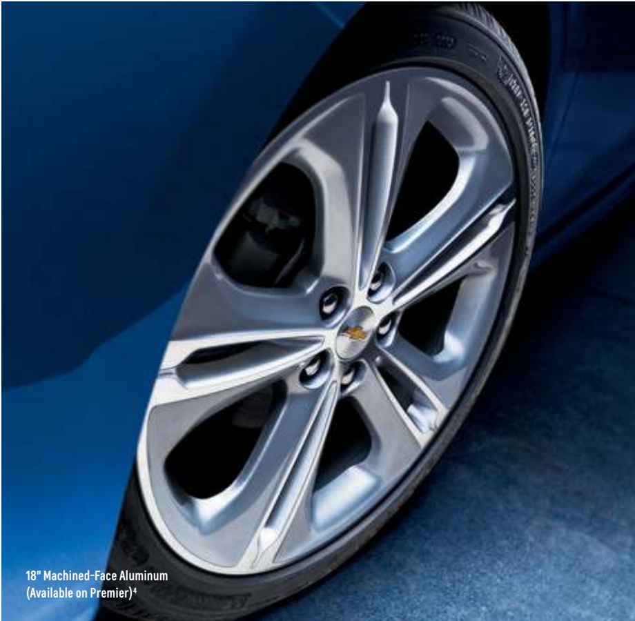
18" Machined-Face Aluminum (Available on Premier) 4