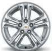
16" Aluminum (Standard on LT)