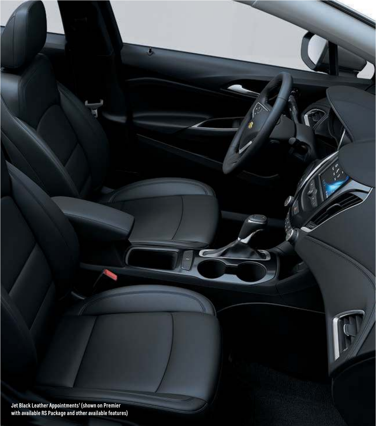
Jet Black Leather Appointments 1 (shown on Premier with available RS Package and other available features)