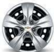
15" Steel with Painted Wheel Covers (Standard on L and LS)