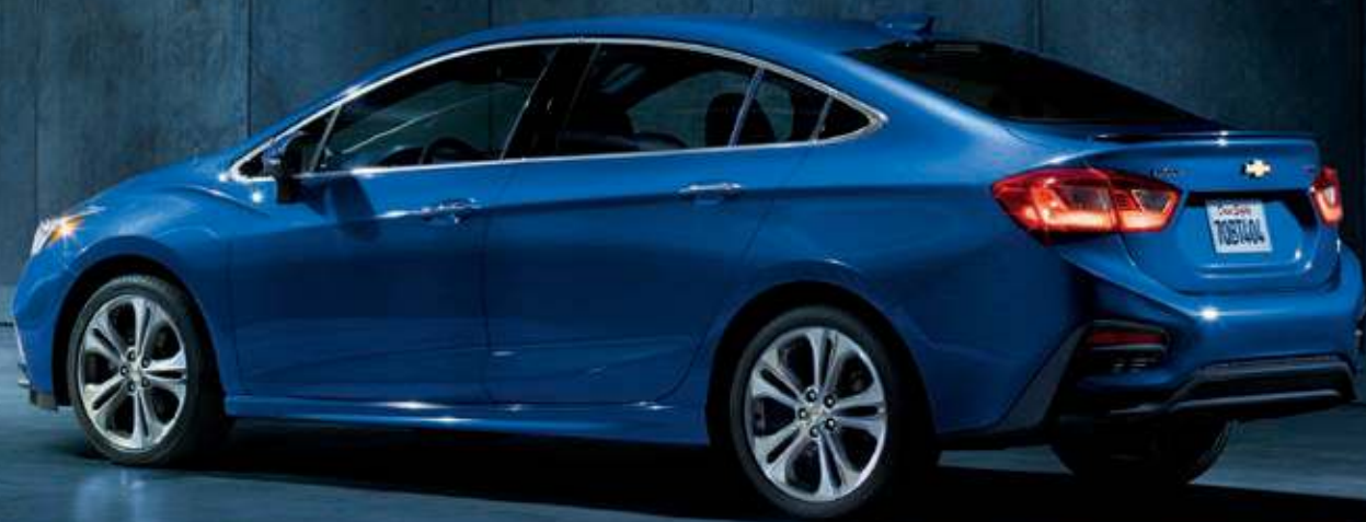
Cruze Premier in Kinetic Blue Metallic (extra-cost color) with available features including the RS Package.