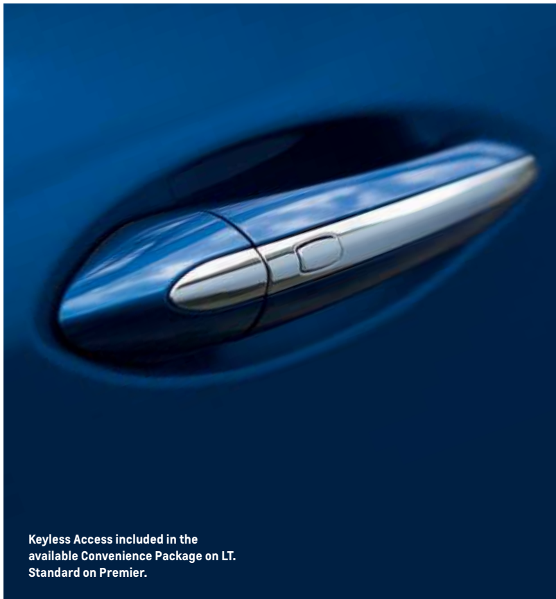
Keyless Access included in the available Convenience Package on LT. Standard on Premier.