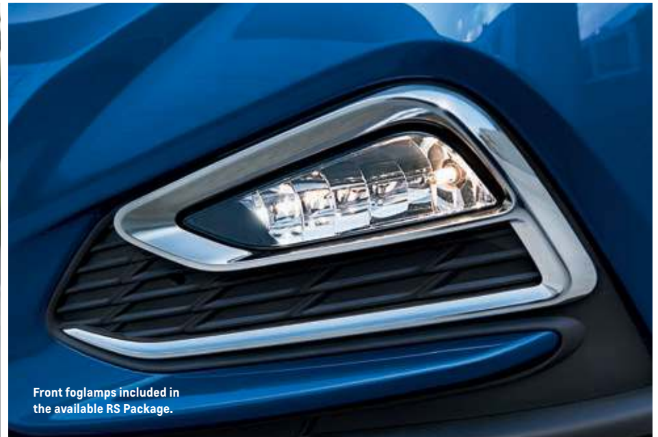
Front foglamps included in the available RS Package.