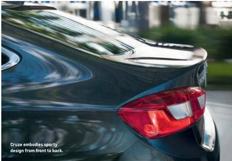
Cruze embodies sporty design from front to back.