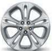
18" Machined-Face Aluminum (Available on Premier) 4