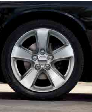
17-inch aluminum (standard on SE and SXT)