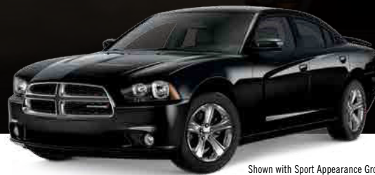
Shown with Sport Appearance Group