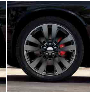
20-inch Black Vapor Chrome forged aluminum (optional on SRT)