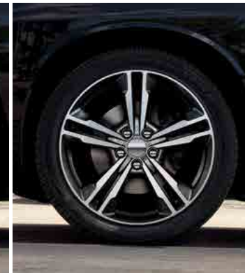
19-inch polished aluminum with Gloss Black Pockets (included in AWD Sport Appearance Package on SXT, SXT Plus, R/T and R/T Plus)