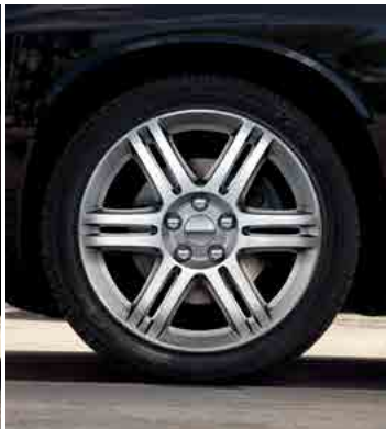
18-inch polished aluminum (standard on R/T, optional on SXT)