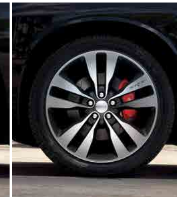
20-inch forged aluminum with polished face and Black pockets (standard on SRT)