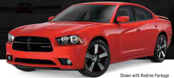
Shown with Redline Package