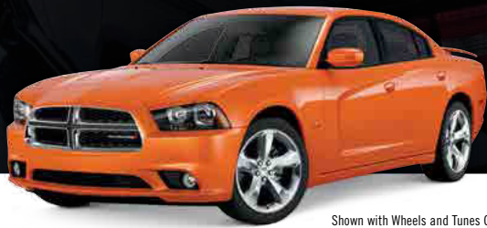
Shown with Wheels and Tunes Group