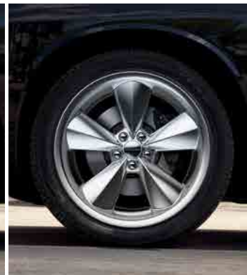
20-inch Classic II polished forged aluminum (optional on R/T Road & Track and Rallye Appearance Group on SXT and SXT Plus)