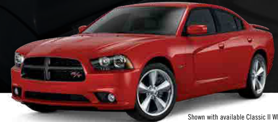
Shown with available Classic II Wheels