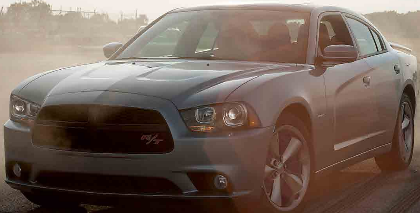
Charger R/T Road & Track shown in Granite Crystal Metallic with available Black roof and 20-inch polished forged aluminum Classic II wheels.