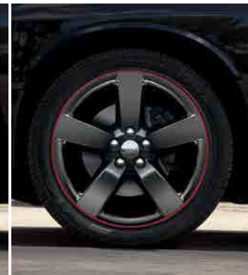
20-inch Black Chrome aluminum with Red lip/backbone (included in Redline Package on SXT and SXT Plus)