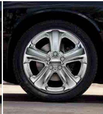
18-inch chrome-clad aluminum (standard on SXT Plus and R/T Plus, included in Sport Appearance Group on SE and SXT)