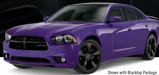
Shown with Blacktop Package