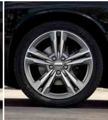
19-inch Satin Carbon aluminum (standard on all-wheel-drive [AWD] models)