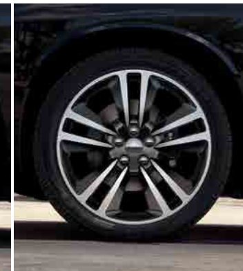
20-inch cast aluminum with Black pockets (standard on SRT® Super Bee)