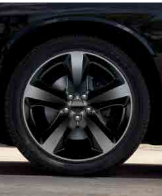
20-inch Gloss Black aluminum (included in Blacktop Package on SXT, SXT Plus, R/T and R/T Plus)