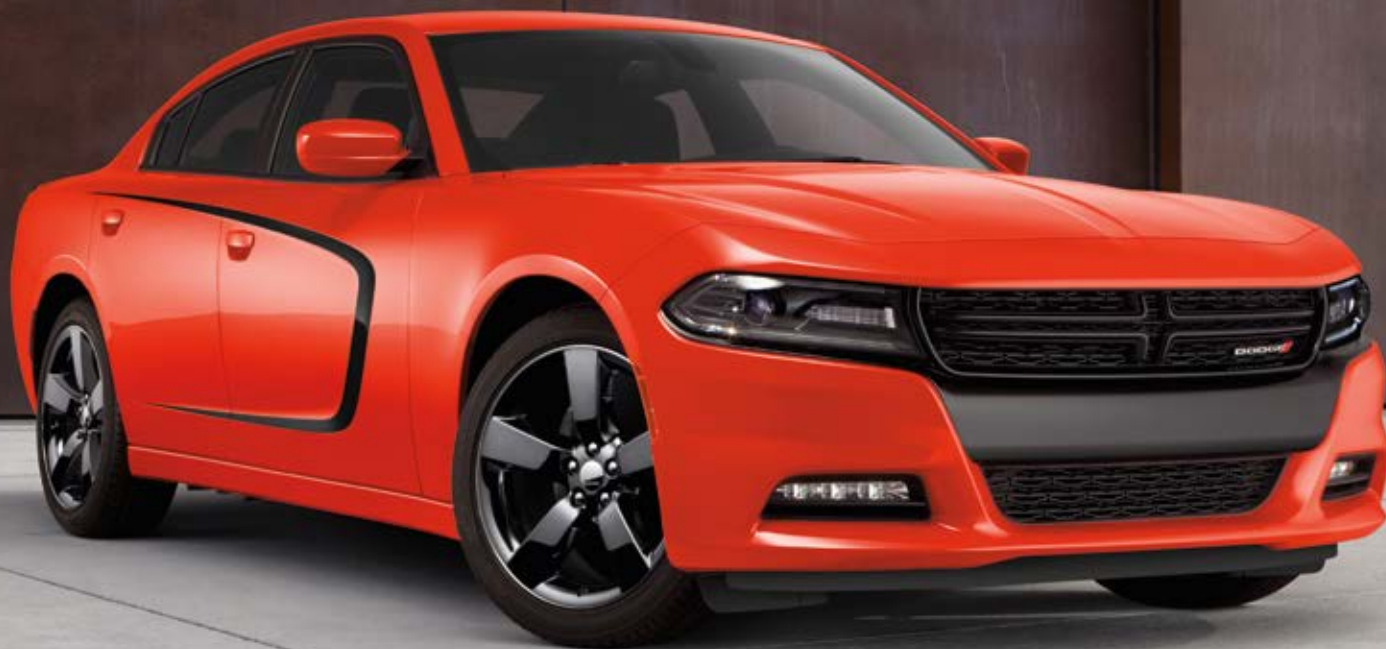
///// Dodge Charger SXT shown with Authentic Dodge Accessories by Mopar®: Matte Black Bodyside Graphic and 20-Inch Black Chrome Wheels.

///// ALWAYS AT YOUR SERVICE. The story of Mopar began nearly 80 years ago with a focus on motor parts and the introduction of a simple can of antifreeze. Through the decades, we have grown into so much more. Today, as the official service, parts and customer care provider for FCA US LLC Brand vehicles, we walk alongside you as your partner in the vehicle ownership experience. That's why we offer authentic parts and accessories designed by the same engineers that created your vehicle to make it truly yours . It's why our team is comprised of expert dealer technicians who know your make and model best, armed with leading-edge diagnostic technology no one else can match. And it's why we've created unique services like Mopar Owner Connect, Express Lane Service and Mopar Vehicle Protection® plans to offer convenience and peace of mind. In short, we are not only here to service cars, trucks, minivans and SUVs — we are here to service people's lives. It's this commitment that fuels who we are. And it's our promise to you that Mopar will always be at your service. See your dealer for the full line of Authentic Accessories available for your Dodge vehicle, or visit mopar.com