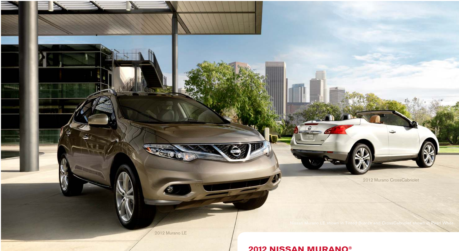
2012 Murano LE