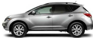
SV: PICTURE OF VERSATILITY