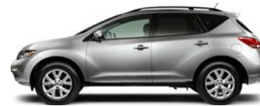
SL: STATEMENT OF BEAUTY