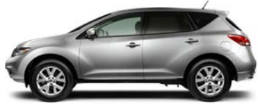
S: REDEFINITION OF ADVENTURE