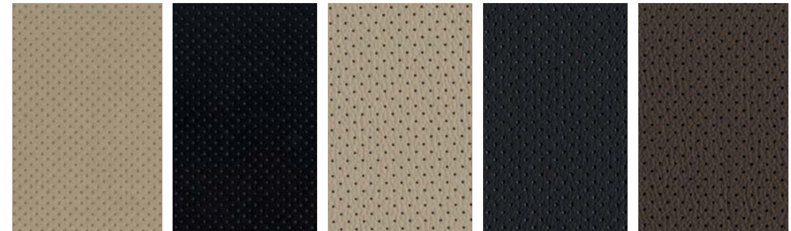
Cashmere Cloth SV Graphite Cloth S | SV Cashmere Leather SL | PLATINUM Graphite Leather SL | PLATINUM Mocha Leather SL | PLATINUM