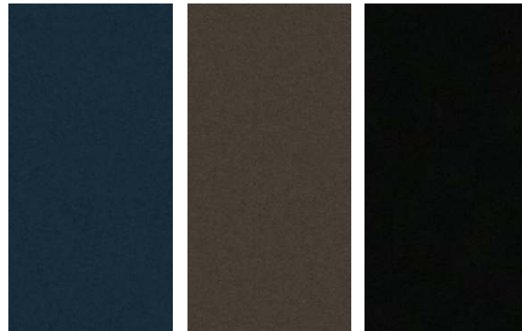
Arctic Blue Metallic RBG Java Metallic CAJ Magnetic Black G41