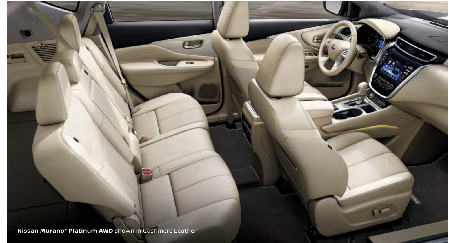
Nissan Murano ® Platinum AWD shown in Cashmere Leather.